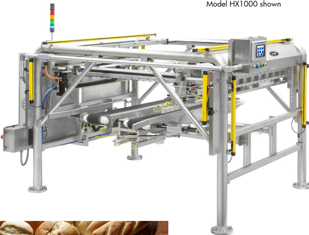
Model HX1000 shown